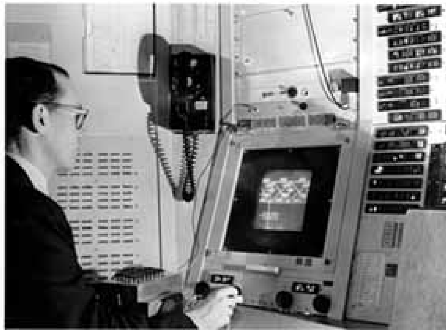
Ivan Sutherland, Sketchpad Project, MIT, 1963